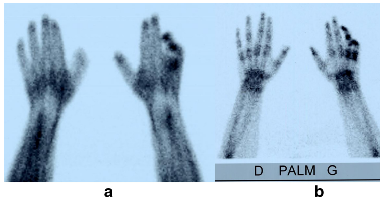
Figure 2 Three-phase bone scintigraphy: early phase (a) and delayed phase (b) Same patient as Figure 1. Staged early and delayed hyperfixation on 4 th and 5 th fingers suggesting CRPS stage 1.

with a duration of less than 3 months. In our study, TBPS was also particularly helpful when it was performed in the first 6 months. Figure 2 shows the TBPS images in a partial form. Taking all these results together, the role of TBPS in the diagnosis of CRPS is still uncertain. It is certainly not a screening tool for diagnosis of CRPS in which clinical findings remain the gold standard. Nevertheless, we believe that TBPS should be only recommended in the first months of the disease progression for unclear situations which do not fully meet the Budapest criteria [29,30]. Based on the present knowledge, we have proposed a diagnosis flow chart (Figure 3) on the application of the Budapest criteria and of radiology in cases of partial CRPS.