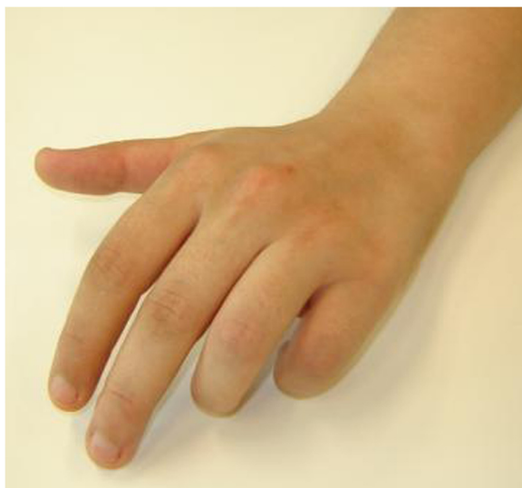
Figure 1 Clinical aspect: 23-year old female patient, contusion of the hand, development of pain and attitude of contracture that was partly reduced in the 4 th and 5 th fingers of the left hand.