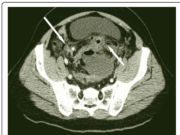
Figure 1 CT Scan showing a necrotic appendix with a stercolith (long arrow) and anterior wall perforation (short arrow).

Histopathology showed a perforated appendicitis with severe peritonitis, as well as large necrosis formation of sigmoid mesenteric adipose tissue and a necrotic ulcer measuring 1 cm square on the anterior wall of the rectum. Since no diverticular disease could be detected, it was strongly assumed that necrotizing appendicitis