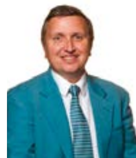
Pr Wassim Raffoul

There is no conflict of interest to declare