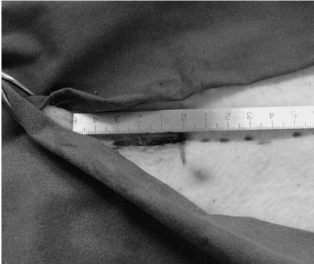
Fig. 1. An incision 3 cm long 16 cm below the sternum.

removed and the ventricle access closed with an occluder (Fig. 2A and Video 1, see Video 2 for a fluoroscopic view). Animals were then followed up for 1 h, and haemodynamics data were collected. The animals were subsequently sacrificed and gross anatomy examination of the heart carried out (Fig. 2B). Pericardial bleeding was assessed using a conventional suction device during the procedure.