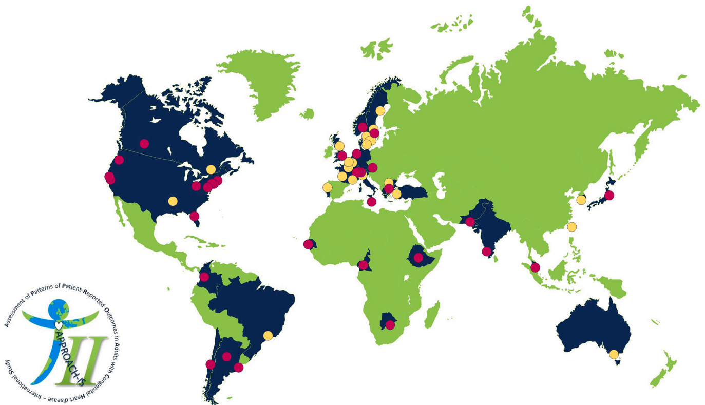
Fig. 2. Geographic distribution of the APPROACH-IS II participating centers. Yellow dots indicate centers that are participating in Part 1 and Part 2 of the study ( n = 21 ). Pink dots indicate centers that are participating in Part 1 only ( n = 32 ). (For interpretation of the references to colour in this figure legend, the reader is referred to the web version of this article.)

participating centers have a local principal investigator, responsible for the study execution in their center.