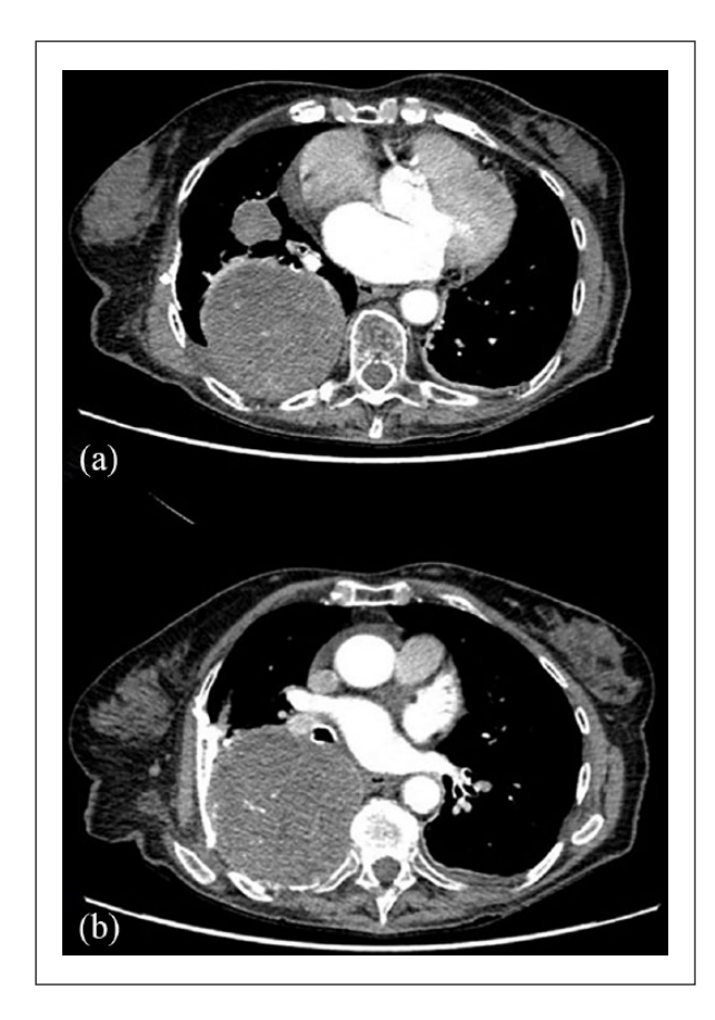
Figure 2. (a, b) Chest CT scan of the second recurrence with two large vascularized pleural masses, despite the two previous arterial embolizations.

lobe (Figure 2). Chest wall was reconstructed with mesh and titanium plates (Figure 3). Glycemia was immediately normalized on postoperative course, with values ranging between 6.4 and 10.5 mmol/L. Pathological exams revealed the