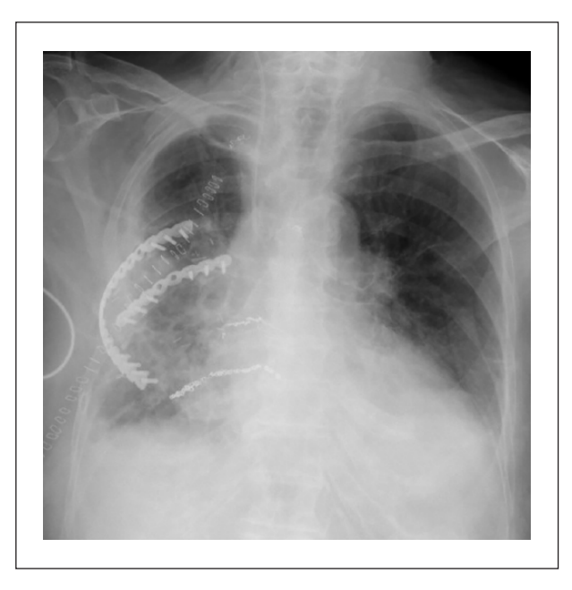
Figure 3. Postoperative chest radiography showing the reconstruction of the chest wall with plates and previous coils in intercostal arteries.

lobe (Figure 2). Chest wall was reconstructed with mesh and titanium plates (Figure 3). Glycemia was immediately normalized on postoperative course, with values ranging between 6.4 and 10.5 mmol/L. Pathological exams revealed the