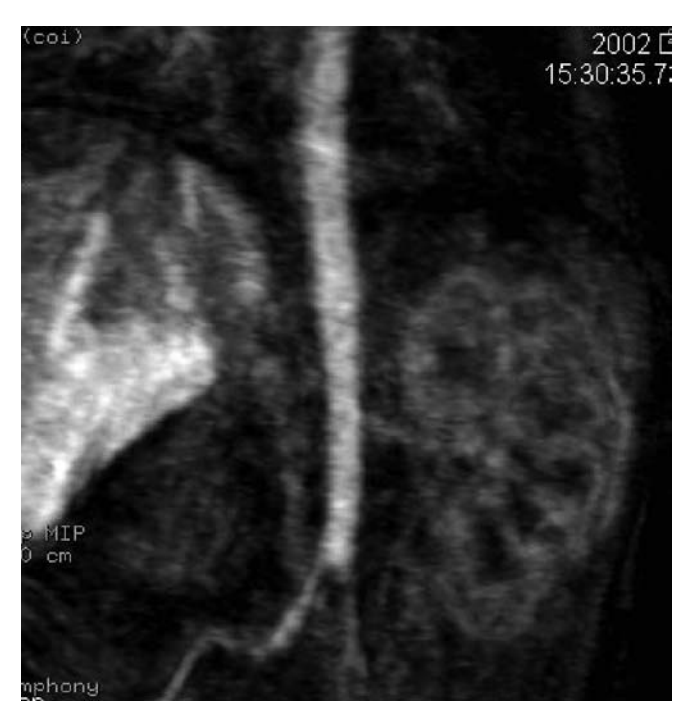
Fig. 2 Abdominal aortic magnetic resonance angiography. The left renal artery and left kidney are clearly delineated. The right renal artery and kidney are not visible

Renal scan (Mag3) performed on day 10 of life showed no activity on the right side and a compensatory hyperactivity on the left side. At discharge (day 18 of life), the patient was normotensive, with a creatinine of 56 \mu mol/l and sodium of 135 mmol/l. Eight months later, she is on enalapril 0.6 mg twice daily, her blood pressure is normal (90/50 mmHg), and she has no proteinuria or hematuria. Follow-up renal ultrasonography, a year later, shows a small atrophic right kidney (<5th percentile) with a hypertrophied left kidney (95th percentile). Echocardiography performed 3 months after discharge is also normal, with complete regression of the left ventricular failure. A repeat renal scan confirmed the total absence