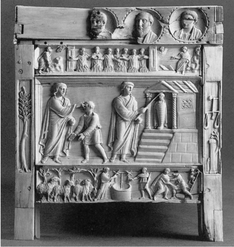
FIGURE 19.3 Reliquary from Brescia (4th c.), right side. The scene of Jacob's struggle is located in the lower frieze devoted to Jacob, at the right end

of God” or “Visible-form-of God” (Gen 32:31). 32 Like many commentaries, 33 a number of early Christian images follow this interpretation, of which the Brescia reliquary and the scene as given in the Vienna Genesis (6th century) are the