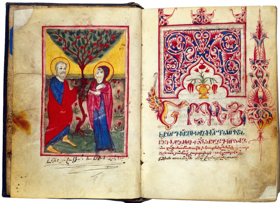
FIGURA 10.2 London, Wellcome Library, ms. 16586, ff. 2 v -3 r : i santi Gioacchino e Anna e, sulla destra, l'incipit dell'inno per la Natività di Maria

LICENCE: ATTRIBUTION 4.0 INTERNATIONAL (CC BY 4.0) HTTPS://WELLCOMECOLLECTION.ORG/WORKS/J4TG4DSP/ITEMS