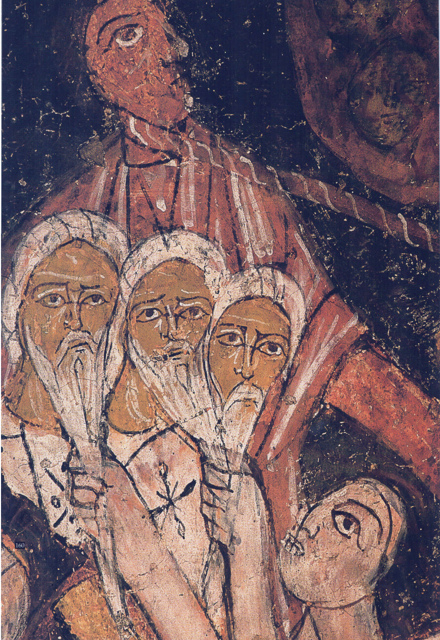
FIGURE 19.5 A demon is pulling the beard of three ecclesiastics in Hades. Fresco of the Karsı kilise, Gülsheir, Cappadocia (13th c.), detail FROM: JOLIVET-LÉVY 2001