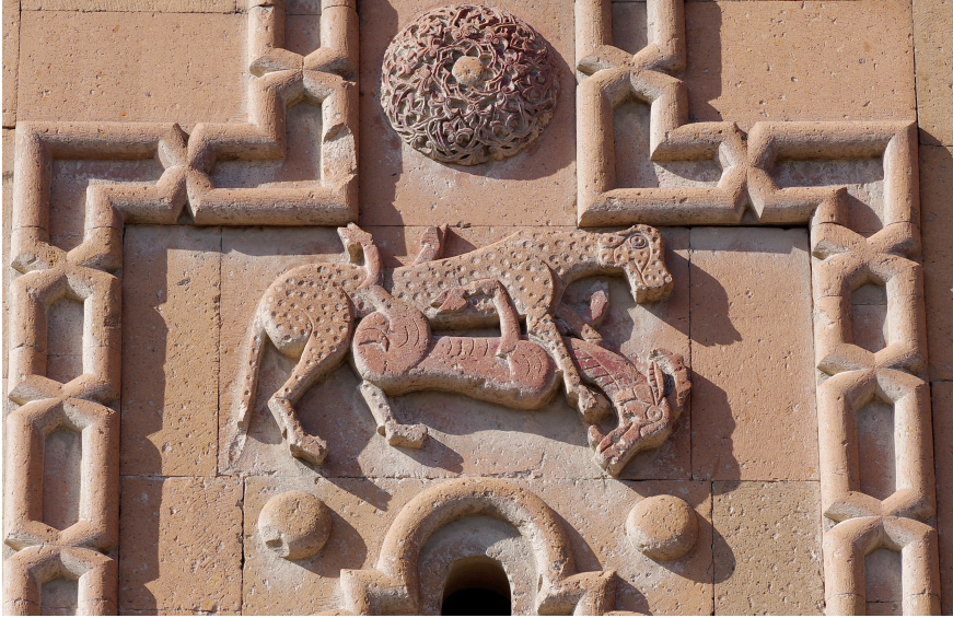
FIGURE 3.3 Surb Astuacacin (Holy Mother of God) Church in Elvard, 1311–1321, east façade, architect Šahik.

JUNE 2015