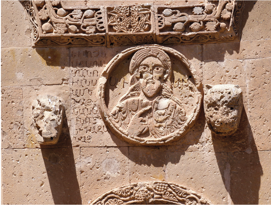
FIGURE 3.4 Adam (Gen 2:20), Surb Xac' (Holy Cross) Church in Alt'amar, 915–921, east façade, architect Manuēl

PHOTO BY HRAIR HAWK KHATCHERIAN, FEBRUARY 2015