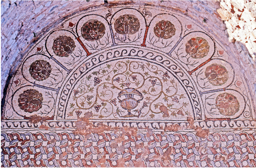
FIGURE 1.5 Mosaic with grapevine issuing from an amphora-chalice surrounded by peacocks, Diaconikon, Basilica A of Doumetios, Nikopolis, 550–575

song concerning his vineyard.” The Lord is the gardener, but in return for his tender care, his vine in Isaiah yields only sour wild grapes. In the New Testament, however, the vine bears a clear Eucharistic message as we find in John 15: 1–8, “I am the true vine, and my Father is the vinedresser,” and the narrative of the Last Supper refers to the fruit of the vine in Mark 14:22–25 and Luke 22:17–20. In the Early Christian church, the Eucharist was celebrated daily and communion was received both as bread and wine. Since peacocks are not a biblical motif, the art historian must infer their meaning from the context. In nature, the peacock bird does not belong in cultivated vineyards but inhabits the tall grasses of wild marshlands and his extraordinary outspread tail is part of his mating behaviour.