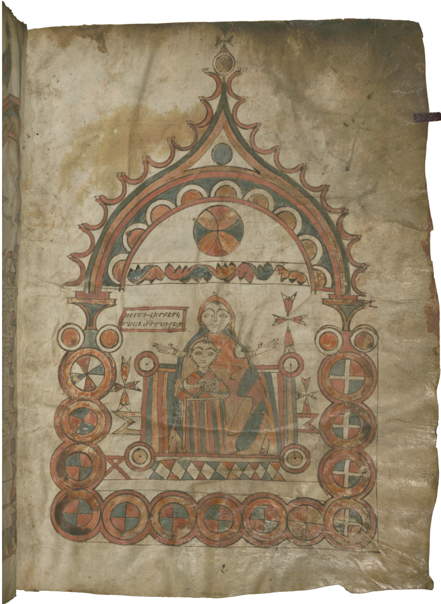
FIGURE 1.6 The wheels of Ezekiel's Vision at the corners of the Virgin's throne, The Virgin and Child Enthroned. Walters Armenian Gospel W 537, fol. 2 recto, 966 COPYRIGHT: THE WALTERS ART MUSEUM, BALTIMORE