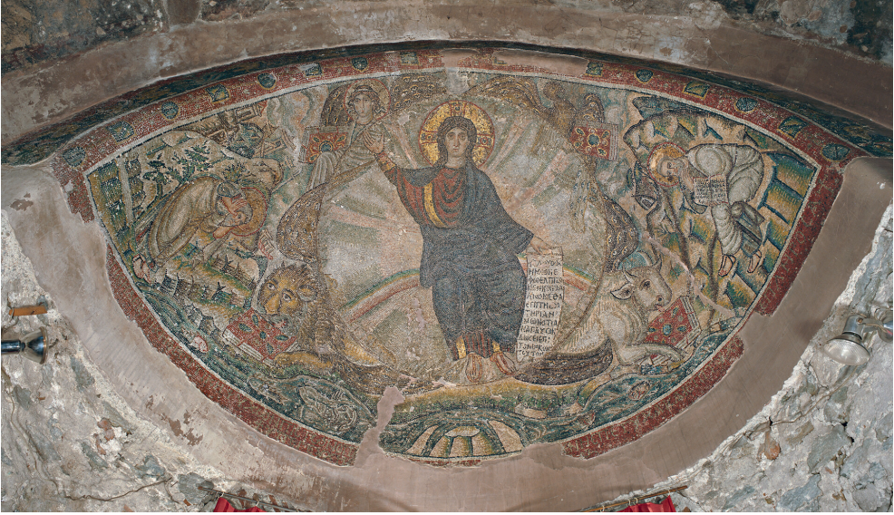
FIGURE 1.2 Mosaic of Christ in the Vision of Ezekiel, apse of Hosios David/Moni Latomou, Thessaloniki, 425–450. Eastmond—Hatzaki 2017, Figure 35 (page 79)