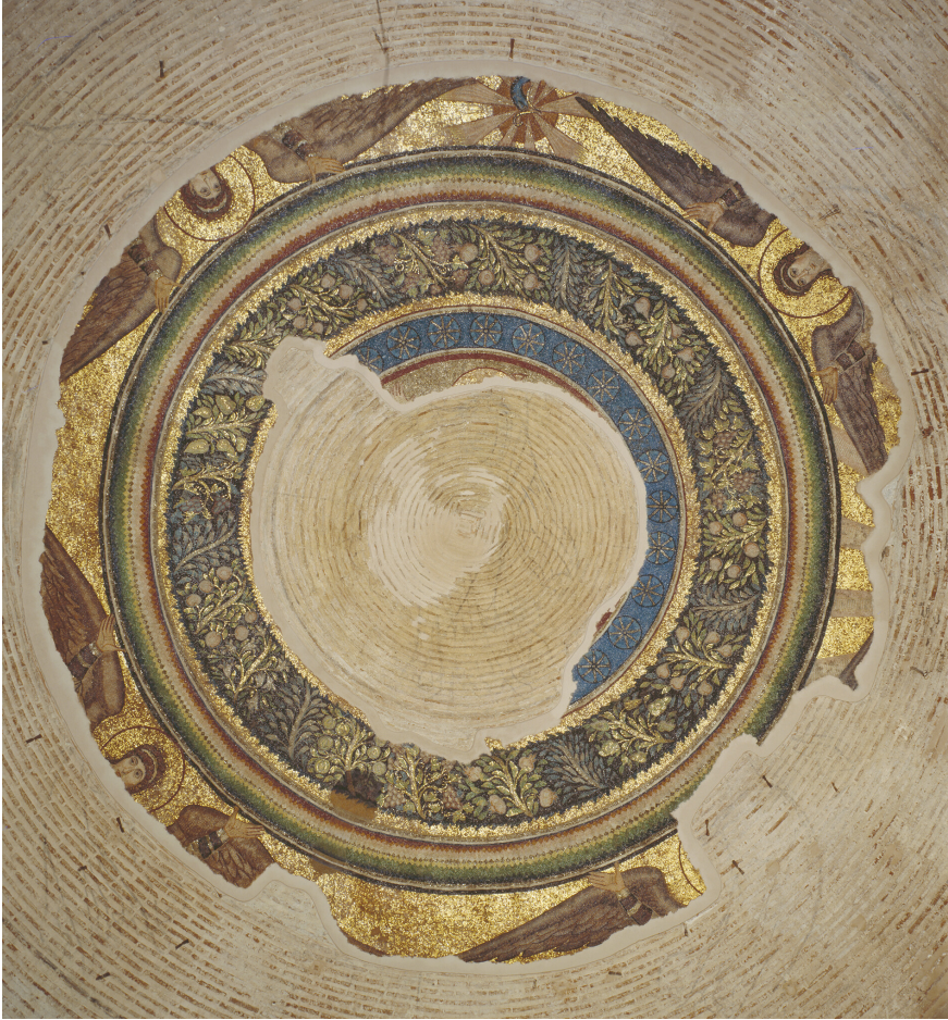
FIGURE 1.1 Mosaic of the medallion of Christ supported by four angels, Rotunda of Thessaloniki, 390s Killerich—Torp 2017, Figure 38 (page 47)

gertips the four angels gingerly support a unique 360° rainbow that encircles the representation of Christ with his right arm raised. In nature one never sees more than a fragment of a rainbow. The full circular mosaic rainbow that embraces the whole congregation below must be credited to the artists' imagination and it illustrates Ezekiel's "glory of the Lord" (Ezek 1:28). The charming human faces of the angels regard us with understanding and concern as they support the great golden wheel of the Lord. In Thessaloniki, the rainbow contains a garland of rich fruit, within which is an inner ring featuring 28 smaller gold wheels with black rims and spokes of gold. Though Küllerich and Torp see