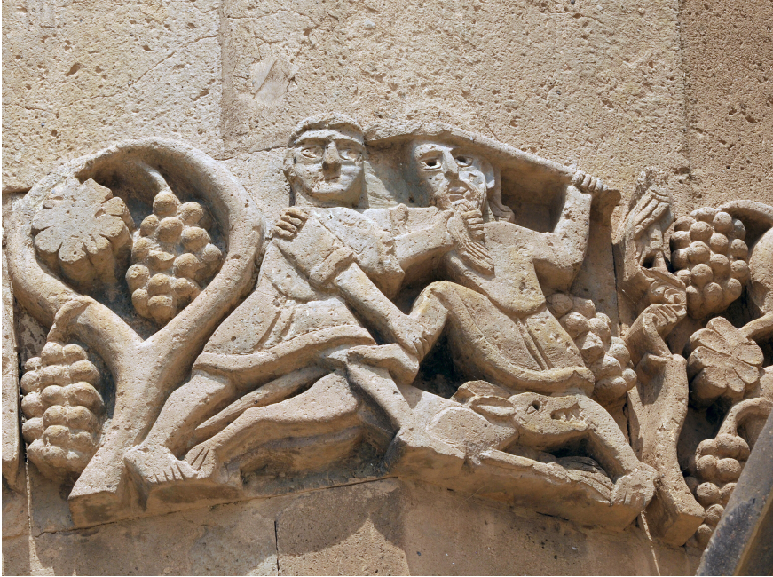
FIGURE 19.2 Jacob's Struggle. The vine frieze of the Church of the Holy Cross at Alt'amar

the right, is more dynamic, showing movement through his raised right leg and while waving a staff in his left hand. Between them is a dog which, with expressive movement, is biting Jacob's left leg (Figure 19.2). 11