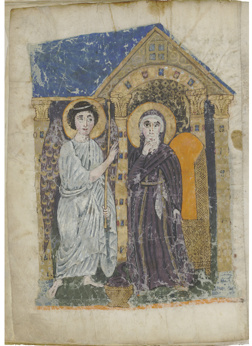
FIGURES 1.3–4 The angel Gabriel with wings of peacock feathers in the Annunciations to Zachariah and to Mary, Matenadaran 2374, fol. 229 r and 229 v , 6th century