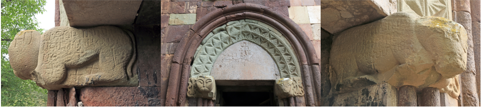
FIGURES 3.2A–C Western entrance of the gavit' of the Xoranašat Monastery, 13th century PHOTO BY AUTHOR, SEPTEMBER 2019

functions are easier to discern especially in those depictions which are accompanied with inscriptions, for they often ask for divine protection for those named in the text. In the 13th-century Xoranašat monastery, for example, two inscriptions are written on two beast sculptures, which also serve as capitals for the western entrance of the gavit' 27 (Figure 3.2). These texts are accompanied with small crosses placed below, in that way filling in the free space remaining on the beasts' bodies. The inscriptions on the two sculpted capitals depicting a lion and a horned animal read as follows, respectively: