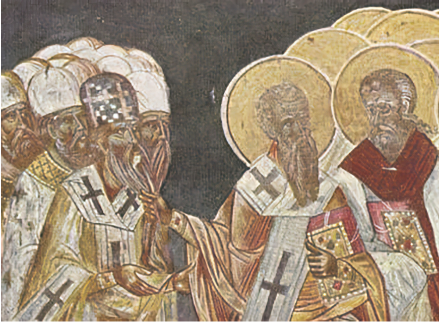
FIGURE 19.6 Council of Chalcedon. Fresco of the Church of Saints Peter and Paul in Veliko Tarnovo, Bulgaria (14th c.), detail

ography occurs on Byzantine documents. The October Volume of the Menologium of Simeon Metaphrastes, copied at the beginning of the twelfth century, 72 contains initials with images, all devoted to the victory of the saints and martyrs over death. In this series, the initial of the life of Epimachos, represents him stamping on and pulling the beard of a defeated figure. 73