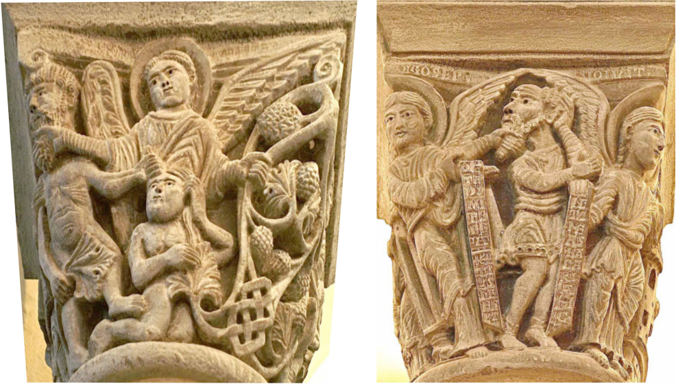
FIGURES 19.7A–B Capitals of the Basilica of the Notre-Dame-du-Port at Clermont-Ferrand, France (12th c.); a) The punishment of Adam and Eve; b) Appearance of the angel to Joseph (Matt 1:19)