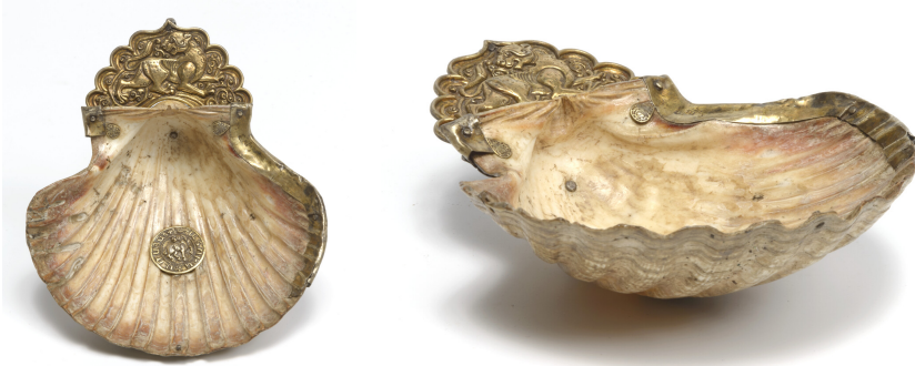
FIGURES 3.1A–B Šahuk's shell, Cilician Armenia, 13th–14th cc. Inv. no. ЧМ-1317

tion and the possible relevance of certain objects to pilgrimage practices are still largely understudied. This paper is an attempt to fill that gap and, because of the lack of previous approaches to Armenian pilgrimage art, it also faces a methodological challenge. Therefore, the reader should not be surprised that the terminology and comparanda used in this article will make use of Western examples and traditions, which have received more scholarly attention so far. This essay is a search for context, and I would like to dedicate it to Theo van Lint, whose work has enriched our understanding of Armenian culture and spirituality.