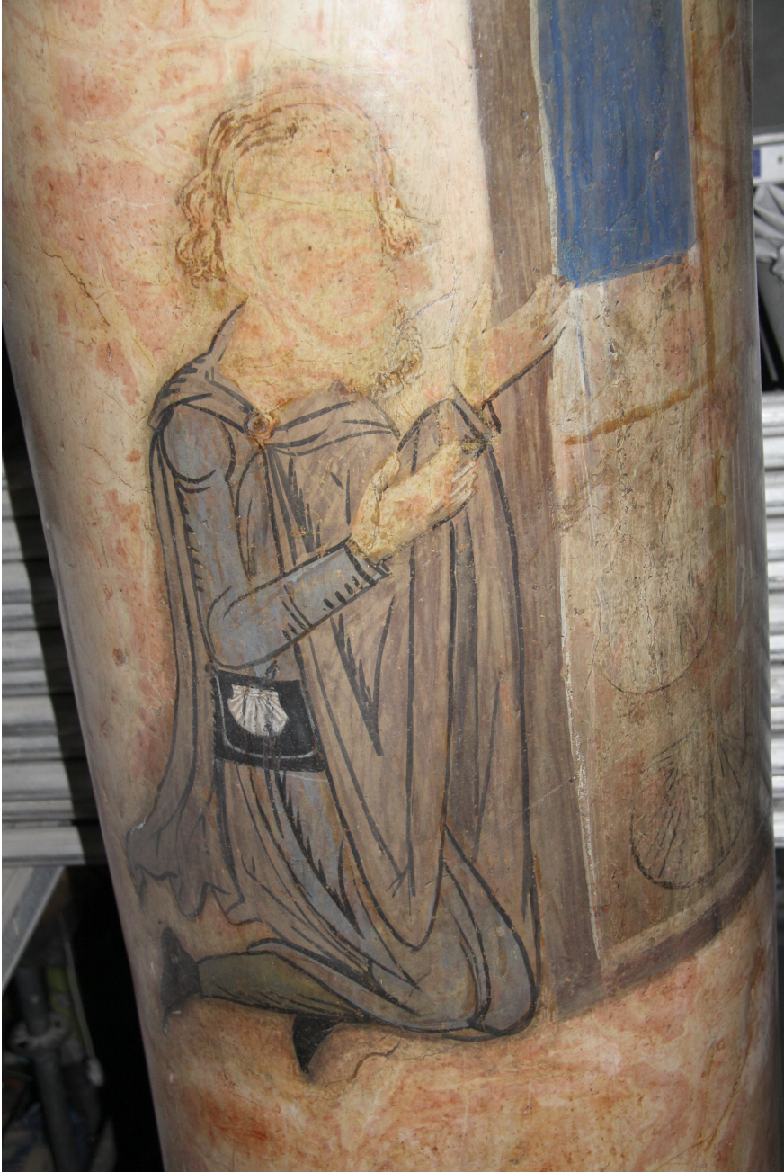
FIGURE 3.5 A Jacobean pilgrim, mural painting, ca. 1150, Nativity Church, Bethlehem PHOTO BY MICHELE BACCI, JUNE 2019