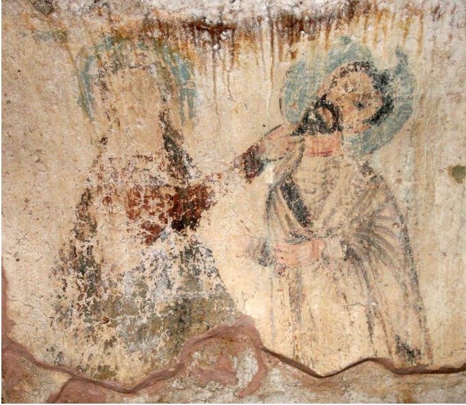
FIGURE 19.4 Christ and the Apostle John. Fresco of the Basilica of the Forty Martyrs in Saranda, ALBANIA (5TH–6TH CC.). FROM: ENDOLTSEVA—VINOGRADOV 2016.

strength, but as a sign of relative position of the two figures, as in the texts cited above. Here are several examples of this theme in art.