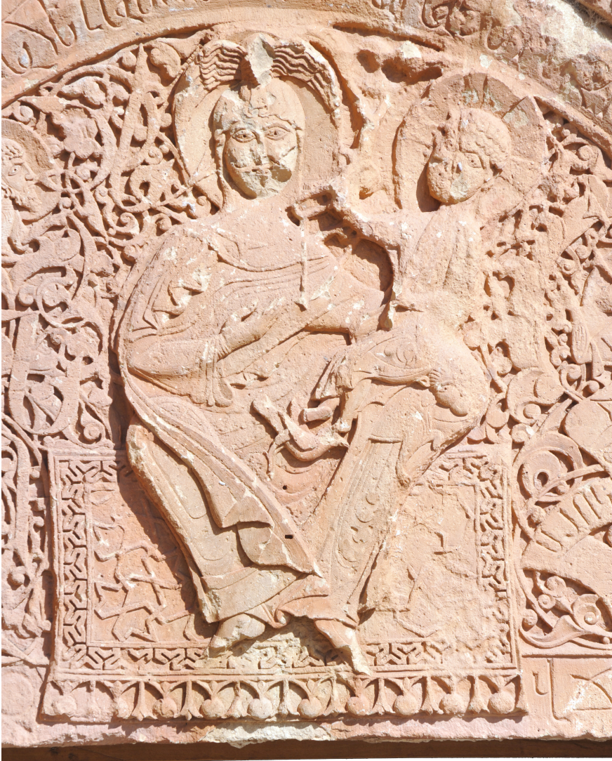
FIGURE 19.8 The Virgin and Child in majesty. Bas-relief on a tympanum on the monastery of Noravank', Armenia (14th c.), detail

© RESEARCH ON ARMENIAN ARCHITECTURE (RAA—ARMENIA)