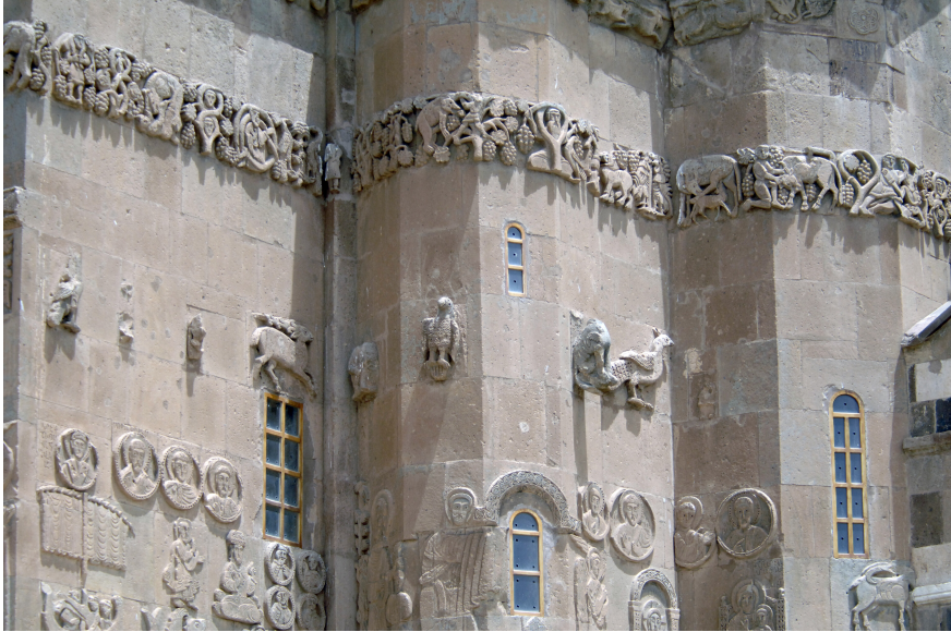
FIGURE 19.1 Church of the Holy Cross at Alt'amar (915–921), south façade

The analysis of the cycles of the patriarchs Abraham and Isaac, as well as that of King David, has shown that the biblical episodes represented in the vine frieze are interpreted christologically; they prefigure the coming of Christ, “the true vine” (John 15:1–7) and convey a messianic message. These scenes require a complex interpretation, because their meaning is expressed in the terms of a symbolic, even cryptic, language, drawing at the same time both from Scripture and from apocryphal writings, together with a profound knowledge of the great exegetes of the Bible. The cycle of the patriarch Jacob takes its place among the Old Testament cycles and one scene of the Jacob cycle is the subject of this article.