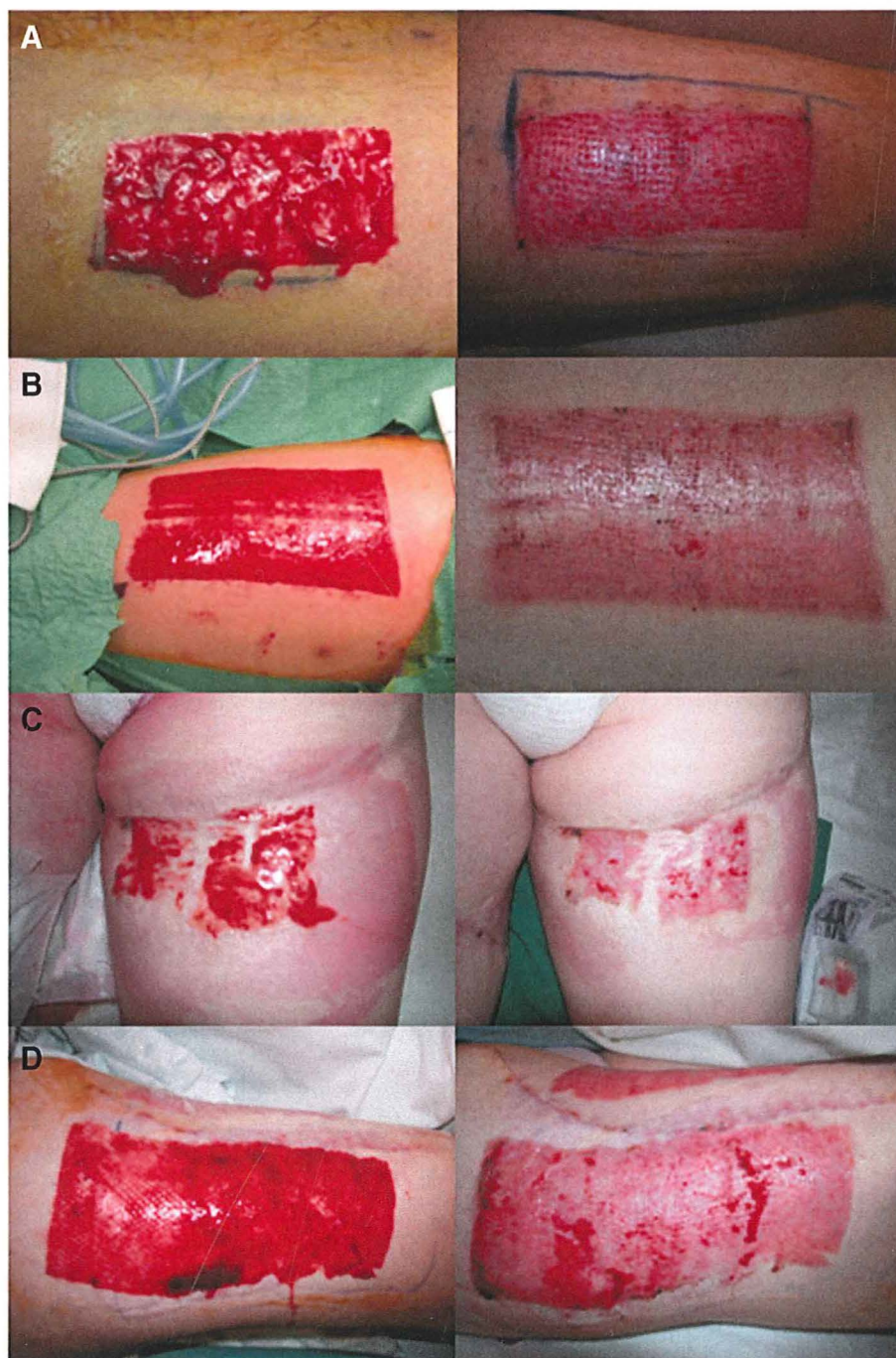
Figure 2 Pictures demonstrate greater amount of epithelialization when treated with platelet concentrate or keratinocytes suspended in a platelet concentrate. (A) and (B) show treatment with PC at operation time (left panel) and seven days later (right panel). (C) and (D) show treatment with PC + K at operation time (left panel) and five days later (right panel).

however becomes consequential relative to the wound surface to be covered [9,33,34].