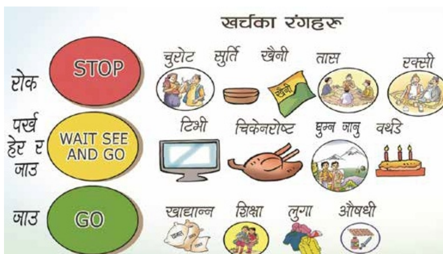
Figure 1. Traffic lights classifying desirable, cautiously desirable, and undesirable expenses.

Finally, FOR-FLE pedagogy attaches hope to insurance products. As a risk-management tool, insurance is promoted to overcome fear of emergencies, to climb the ‘ladder of wealth’, and to realize the promise of happiness. Insurance products are placed at an advanced stage of the ladder. Once you have reached the level of being able to manage future uncertainties through anticipatory risk management technology, you are supposed to be financially disciplined, hence, achieve happiness (SAMI, 2017; SAMRIDDHI, 2020a; Simkhada and Adhikari, 2015). Yet, to get there, transnational families need to curtail their desire to consume and instead adopt a frugal lifestyle in the present. The emotional regime of FOR-FLE establishes a ‘scale of desirability’ through which family expenses are classified into wants, needs and prohibitions, using a traffic light system (see Figure 1). This scale creates a hierarchy of expenses, promoting certain consumption and investments practices (Simkhada and Adhikari, 2015: 37). Through this scale of desirability, the emotional regime of FOR-FLE associates hope with saving and investments, and guilt and shame with consumer spending. This constructs the subject of the “irresponsible consumer” (Arthur, 2018: 446) who is not sufficiently frugal, does not engage in financial planning, and neither saves nor invests. By doing so, it nudges people to “consume responsibly” and adopt prescribed financial behavior in order to realize happiness and prosperity.