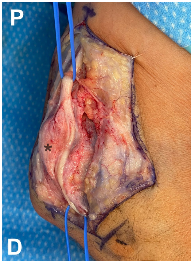
Fig. 2 Intraoperative photograph of the medial aspect of the left elbow showing complete surgical release of the left ulnar nerve located anterior to the medial epicondyle (asterisk). P proximal; D distal

Surgical release of the left ulnar nerve was performed under axillary nerve block and tourniquet. A 12–15-cm longitudinal incision was performed posterior to the medial epicondyle. The ulnar nerve was located anterior to the medial epicondyle (Fig. 2) and complete release of all nerve compression points was performed: the aponeurosis of the flexor carpi ulnaris, the tunnel outlet between the two muscle heads of the flexor carpi ulnaris, the intermuscular septum, and