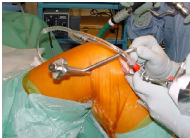
Figure 3 Picture of external view of guide placement on the lateral side of distal part of a right thigh. A little skin incision necessary to perform this technique is showed.

Hamstring tendon graft is positioned such that the mark at 30 mm is flushed with the femoral tunnel, whether BPTB is positioned such that the marked tendon-bone junction is flushed with the intra-articular entrance of the femoral tunnel. BPTB is passed with the cortical surface posterior to keep the tendinous portion of the graft as posterior as possible. Different systems of fixation can be used. Anyway femoral fixation is performed at first. A