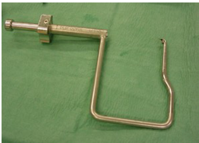
Figure 1 Photograph of the specific rigid femoral drill guide used to create the outside-in femoral tunnel.

With a suture passer, the graft can be passed into the knee by passing a nylon loop-shuttle suture through the joint. The suture at the end of graft is passed in the loop suture,