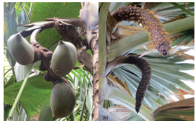
Figure 1. Lodoicea maldivica inflorescences. (A) Female with fruits and unfertilised flowers. (B) Male catkins.

We identified potential sex-linked genetic markers using the approach of Scharmann et al. (2019). Genomic DNA was extracted from the leaf tissue of 20 male and 20 female trees, following an optimised version (Morgan et al. 2016) of the DNeasy® 96 Plant Kit (Qiagen, Hombrechtikon, Switzerland) manufacturer's protocol. The genomes of the 40 individuals were sequenced using a ddRAD protocol (Peterson et al. 2012),