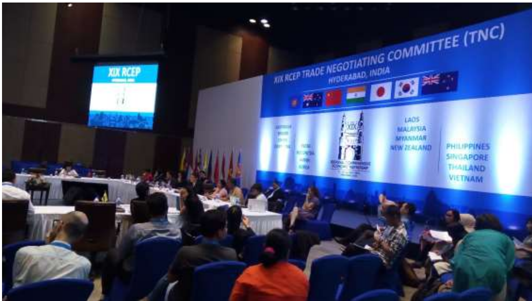
Figure 1 – Activists at the consultation held during the 19 th negotiating round for the Regional Comprehensive Economic Partnership (Don't trade our lives away 2017)

Almost completely excluded from the formal arenas of negotiation for the BTIA and RCEP, activists were also confronted with the lack of access to formal documents such as draft chapters of the agreements and impact analyses. A collaboration with activists engaged against free trade agreements abroad allowed civil society actors in India to address this issue (S. Bhutani). According to Pomeroy (2016, 721), alliances between activists from different countries are indeed a common strategy in order to overcome 'an asymmetry of information between diplomatic representatives and non-governmental actors'. bilaterals.org , a platform created in 2004 as a response to the global increase in bilateral free trade agreements, also provided civil society actors with both formal and non-formal texts. As a 'collaborative clearinghouse on the internet where people [can] find and post their own information and analysis about bilateral free trade agreements' ('About Bilaterals.Org' 2015), bilaterals.org can be described as 'a hyper-organisation that exist[s] mainly in the form of [its] website, e-mail traffic, and linked sites' and amplifies activists' capacities of mobilisation (Bennett 2005, 218). Civil society actors thus gained access to leaked chapters from the BTIA and RCEP, although such documents are often out of date (S. Barria) and do not cover all the areas of the negotiations (S. Gupta). Activists also criticised the technical character of formal texts: