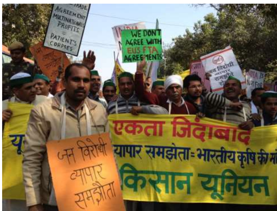
Figure 3 – Farmers belonging to Bharatiya Kisan Union demonstrating against the Bilateral Trade and Investment Agreement in New Delhi (La Via Campesina 2012)

The UPA [United Progressive Alliance] government is in the middle of considering a food security bill, but on the other hand, it is willing to trade away our ability to produce food and our self-sufficiency in food production. The government of India cannot ensure that 1.2 billion people will be fed affordably by importing food. Importing food for our food security will be the end of India's rich agricultural heritage not just because over 65% of the population makes its living through agriculture, but because self-sufficiency in food production is also fundamental to our national security. ('Appeal to Manmohan Singh' 2012)