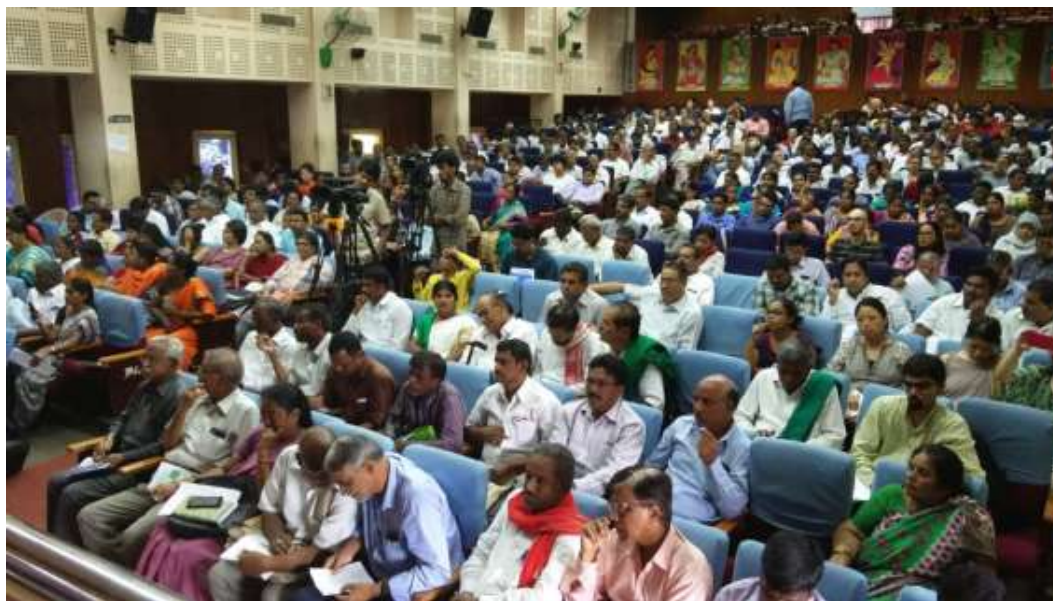
Figure 5 – Activists at the 'People's convention' in Hyderabad (IndustriAll 2017)

A consequence is that activists made a claim for access to formal documents – through information release – and access to formal spaces – through consultation processes and their inclusion as 'key constituents' (Mital et al. 2008). In doing so, civil society actors adopted a confident position and called upon authorities on their behalf. According to them, during trade talks for the BTIA and RCEP, the negotiating parties and especially India were accountable to civil society. Such an assertive role clearly differs from activism against agreements between African, Caribbean and Pacific countries and the European Union, characterised by civil society actors' rationalised language and retiring stance (Del Felice 2012, 320-321).