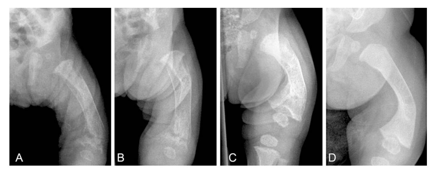
Fig. 4 X-ray films of the left femur demonstrating the changes over the first 4 months of life in case 1. A 4 days: the femur is osteopenic and bent with a sleeve of calcification around an inner bone. The area proximal to the distal femoral metaphysis appears unossified and the metaphysis itself is frayed and expanded, as is the proximal tibial metaphysis. B 2 weeks: the bend in the femur is even more acute at this age with worsening of the metaphyseal changes. C 6 weeks: with introduction of vitamin D therapy, the osteopenia has lessened, the metaphysis is less irregular, and periosteal cloaking is resolving. D 4 months: the metaphyseal changes have resolved and the texture of the bone is improved. A degree of diaphyseal expansion remains, as is typical for severe dysostosis multiplex in ML II

but delayed course. However, the child continued to be unwell and her facial features coarsened. The diagnosis of ML II was confirmed by assay of enzymes in serum: arylsulfatase A 114 nmol/h per mg of protein (reference range 21–72 nmol/h/mg protein) and total hexosaminidase 64180 nmol/h per ml (reference range 2350–2450 nmol/h/ml). The radiological changes, in particular the ribs, evolved into typical dysostosis multiplex (Fig. 5). She suffered recurrent aspiration pneumonias and died at 5 months of age.