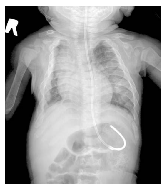
Fig. 5 PA film of the chest (case 1) at 4 months shows the greatly expanded ribs, typical of ML II

This patient was born at 36.5 weeks to an 18-year-old G1P0 mother. The parents were first cousins of Pakistani origin. The pregnancy had been complicated by oligohydramnios and poor growth. Following the onset of preterm labour, the child was delivered by caesarean section for breech presentation. He was noted to be small for gestational age with a birth weight of 2.1 kg (<10th percentile), head circumference of 31.5 cm (10th percentile) and a birth length of 43 cm (<10th percentile). The patient also had bilateral inguinal hernias and club feet. He had poor respiratory effort at birth and briefly required positive pressure ventilation. His Apgar scores were 5 at 5 min and 9 at 10 min. He was transferred to Johns Hopkins Hospital at 1 week of life for further investigation and treatment.