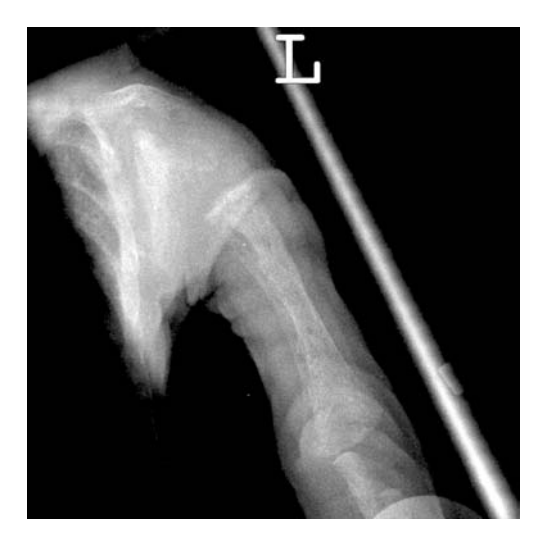
Fig. 2 X-ray film of the left humerus of case 1 on day 4 showing osteopenia and cloaking as well as expansion at the proximal metaphysis. Note also the poor cortical delineation of the lateral aspect of the scapula

On day 2 of life, the total serum calcium was 2.24 mmol/l (reference range 2.12-2.62 mmol/l) and the ionised calcium 1.16 mmol/l (reference range 1.14–1.29 mmol/l). On day 4 of life, the phosphate was 1.12 mmol/l (reference range 1.30–2.20 mmol/l), and the ALP was 711 U/I (reference range 185–555 IU/I). On further investigation, the serum PTH was also elevated, measuring 471 ng/l on day 10 of life (reference range 10–65 ng/l) and peaking at 1178 ng/l at 2 weeks of age. On day 10, serum 25-hydroxyvitamin D (25OHD) was 18 nmol/l (reference range 25-90 nmol/l) and 1,25-dihydroxyvitamin D (1,25D) was 100 pmol/l (reference range 40-140 pmol/l). In a maternal blood sample, the following serum parameters were normal: calcium (2.16 mmol/l), phosphate (1.42 mmol/l), ALP (131 IU/l; reference range 25-100 IU/l in adults), PTH (52 ng/l), 25OHD (47 nmol/l) and 1,25D (51 pmol/l).