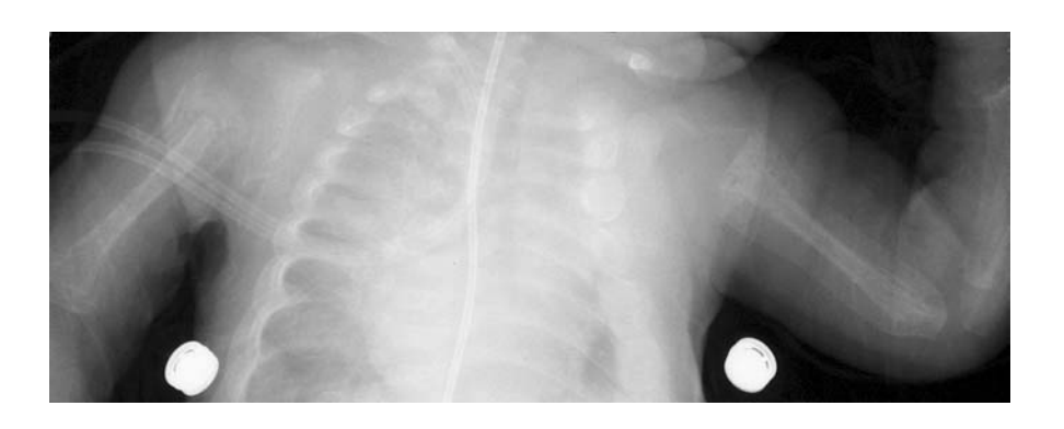
Fig. 7 X-ray film of the humeri and upper chest of case 3 at 8 days. Both humeri have a cloaked appearance (bone within a sleeve of bone) and the ribs are osteopenic and somewhat broadened

On the 1st day of life, serum phosphate was 2.2 mmol/l, total calcium was 1.9 mmol/l, and the ALP was 498 IU/l. A renal ultrasound was normal with no evidence of nephrocalcinosis. On day 26, the 25OHD was 25.0 nmol/l and 1,25D was 149 pmol/l. A PTH level was markedly elevated at 651 ng/l and at 2 months remained elevated (358 ng/l). ALP continued to rise and was 1015 IU/l at 1 month. At this time, the serum calcium and phosphate remained in the normal range at 2.2 mmol/l and 1.9 mmol/l respectively. Both parents were evaluated when the baby was 6 weeks old and their