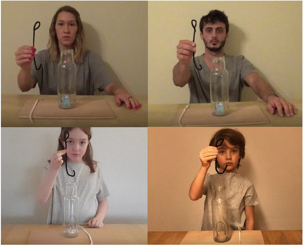
Fig. 1. Four demonstration videos showing the four demonstrators presenting the unnecessary action (i.e., the loop at the top of the hook).

the pre-demonstration phase, and 22 of the 33 children (67%) were successful in the adult demonstration. This difference was not significant, \chi^2 = 1.04 , p = .309 . After the demonstration, 53 children (81%) were successful overall, that is, 24 of the 32 children (75%) in the child demonstrator condition and 29 of the 33 children (87%) in the adult demonstrator condition. The comparison of these two proportions of successful children in the two conditions revealed that they were not statistically different, \chi^2 = 1.04 , p = .309 .