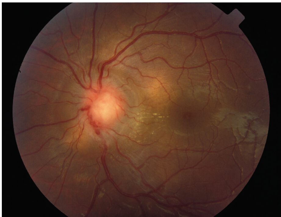
Figure 2 Fundus photograph OS shows the optic nerve granuloma caused by direct sarcoid tissue infiltration.