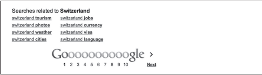
Fig. 4. Related searches to 'Switzerland' on Google Switzerland.

Have you ever misspelled a word in the search query field? Google's algorithms will immediately ask 'Did you mean...?' and suggest the corrected word. Even without misspelling, Google's autocompletion will suggests words and expressions to us before we finish typing . Thus, these algorithms mediate semantically between what we mean and which words we will use to describe it. All of them are so-called 'linguistic prosthesis', potentially impacting the written expression of our thoughts. 16