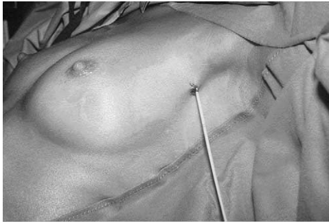
Fig. 2. Postoperative result after one port thoracic sympathectomy by use of a paediatric urologic cystoresectoscope.

with an excellent cosmetic result (Fig. 2). The shoulder girdle function was symmetrical in all patients and no residual pain syndrome was noted.