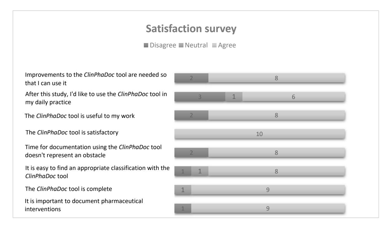
Figure 3. Results for the online satisfaction survey.

Each participant completed an online satisfaction survey, and the results are shown in Figure 3. When asked about potential modifications to the ClinPhADoc, the major improvement suggested by participating pharmacists was the development of an electronic version including protected storage of the documented clinical activities.