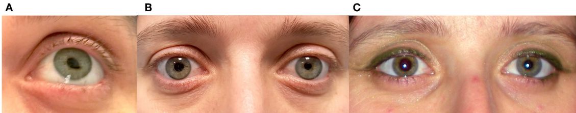
FIGURE 2 | (A) Left eye of patient 2 during one episode of tadpole pupil. Note the tear-shaped deformation of the pupil. (B) Between episodes, examination showed an anisocoria with left pupillary miosis. (C) The anisocoria had been noticed by the patient for 15 years, as shown in this photograph taken 15 years previously.