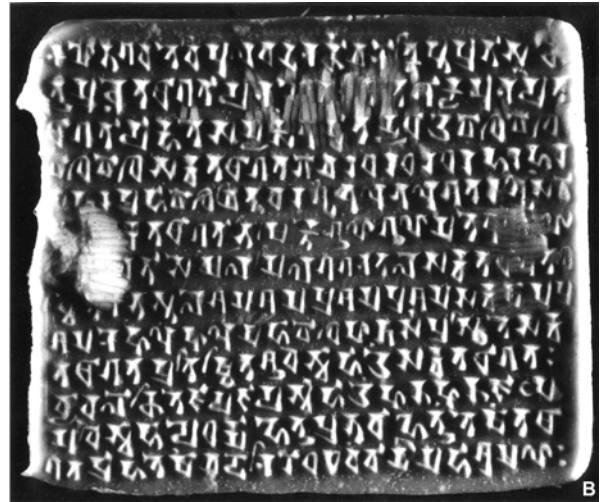
Plate 4.3: Afghanistan stamp with the text of the Bodhigarbhāṃkāralakṣa dhāraṇī from a private collection.