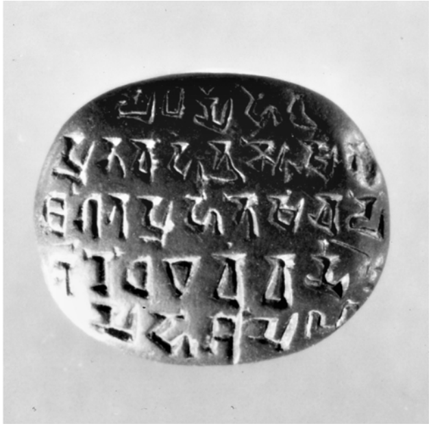
Plate 4.1: Soap-stone seal from the British Museum, London, acc.no. OA 1880-167.

The text of the ye dharmā formula reads: