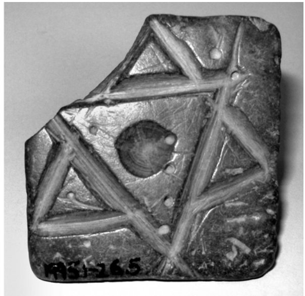
Plate 4.2: Unscripted soap-stone seal from the British Museum, London, acc.no. OA 1995 1-26.5; 5.5 x 5.2 cm.