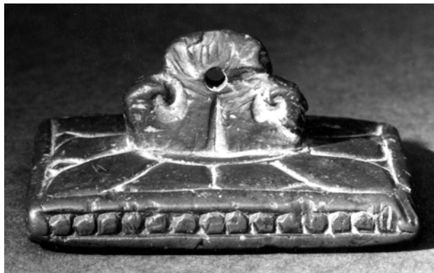
Plate 4.4: British Museum stamp with the text of the Bodhigarbhāṃkāralakṣa dhāraṇī, acc.no. OA 1880-168.