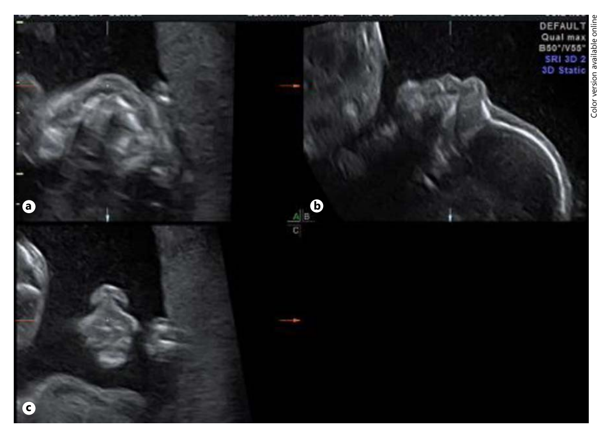
Fig. 2. Image of the reconstructed three orthogonal planes (a axial, b sagittal, c coronal).