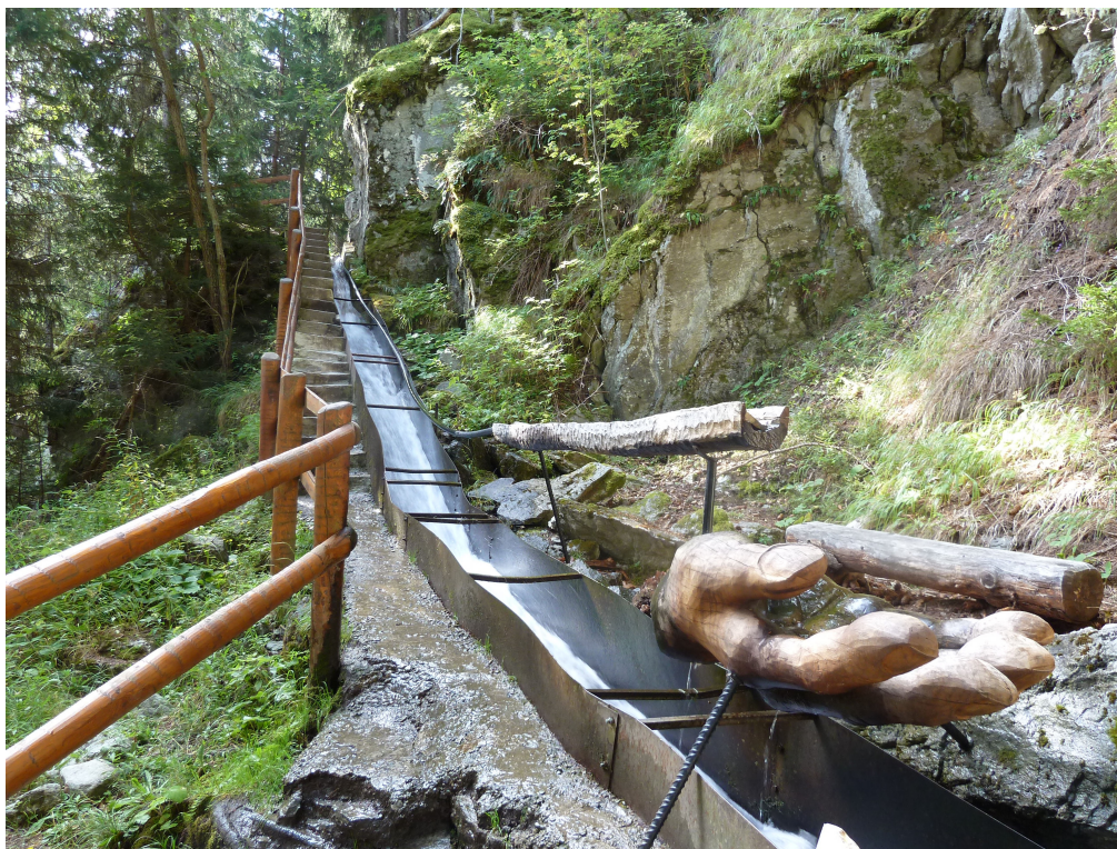
Figure 4. Bisse Vieux, the “Passage du Dix-Huit”