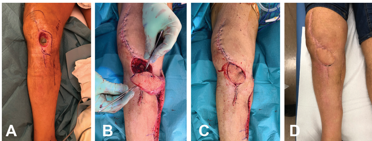
Fig. 2 Patient no. 9 sustained an infection of a total knee prosthesis (TKA) (A). A two-stage surgical procedure was performed including extensive soft tissue debridement, TKA exchange with cemented spacer and soft tissue reconstruction using a chimeric gastrocnemius-MSAP (B), the skin flap was rotated to the defect with an angle of 45 degrees (C). Follow-up at 2 months (D).