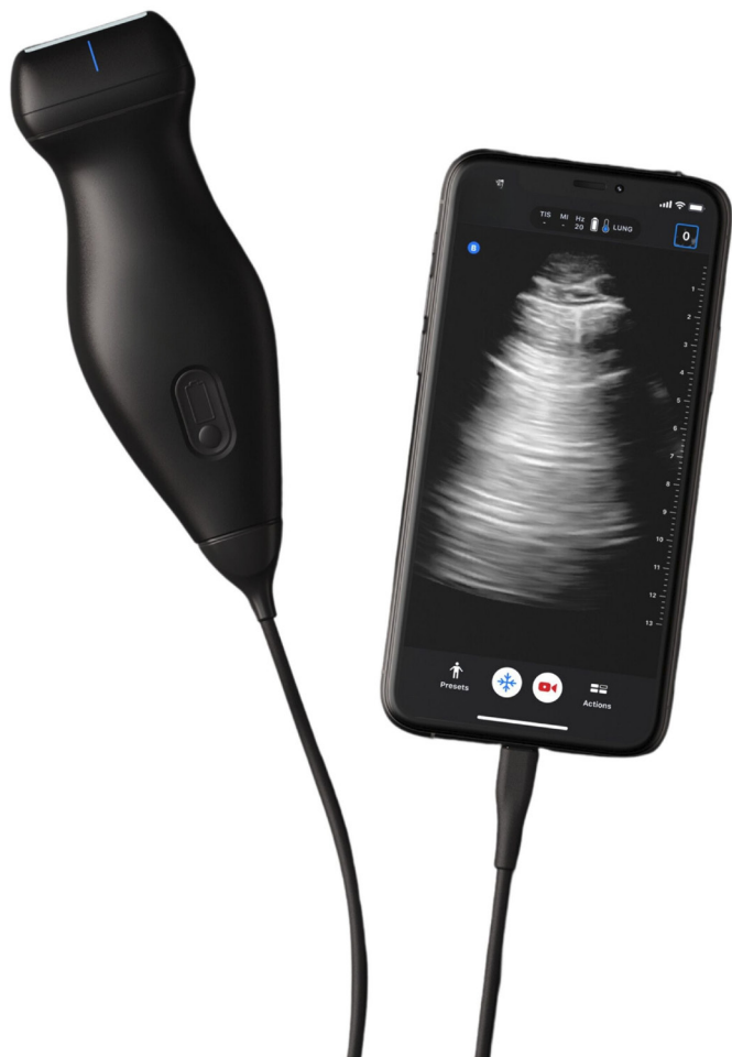
Figure 1 Portable one-probe point-of-care ultrasound device compatible with smartphone or tablet computer that was used during training and further practice.

the development of ultrasound-on-a-chip technology, ultrasound is now available as a portable, pocket-sized mobile health device. 7 Owing to its ease-of-use, affordability and low maintenance and consumable requirements, POC-LUS has emerged as an attractive skill in resource-low settings, where limited access specialist care and inconsistent radiology services erode health equity.