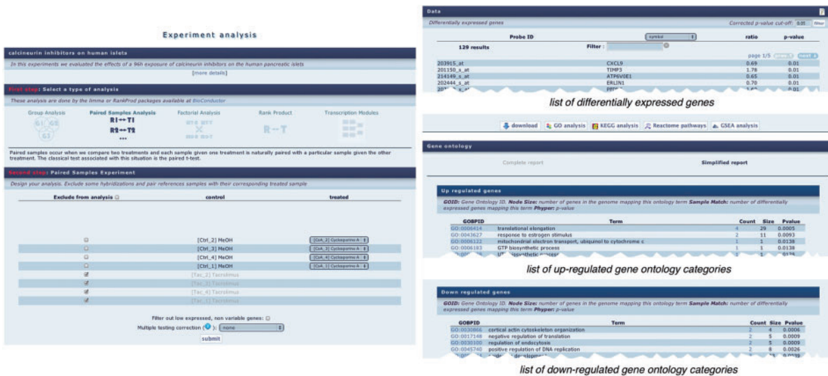
Figure 2. Experiment analysis. The order of the boxes reflects the flow of analysis steps. From top to bottom and left to right, the experiment name and description, the selection of the type of analysis, the form to describe analysis design (for this example, paired samples design), the list of differentially expressed probes with their relevant gene symbol, expression ratios and P -values of differential expression and the list of altered GO categories is provided.

or pathways with the relevant P -values for enrichment. In addition to these enrichment analyses, a user can also perform Gene Set Enrichment Analysis (GSEA) (14) using ordered gene lists to identify enriched pathways or functionally related groups of genes. The gene lists for GSEA can either be selected from MSigDB (14) or imported by the user.