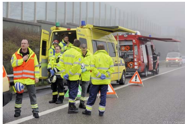
Figure 5. Mobile EMS command post.

and the medical command and control team were dispatched by the 144 center (Table 1). On this occasion, 144 also dispatched the mobile EMS command post