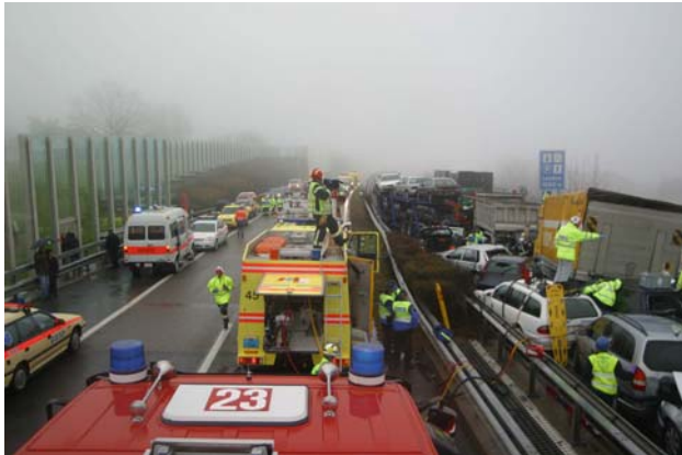
Figure 1. Use of the contra lateral road to gain access to the site.