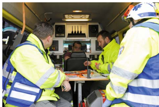
Figure 6. Mobile EMS command post.

(Figures 5 and 6), equipped with all communication devices (radios, mobile phone, computers) and staffed with a 144 dispatcher, allowing medical regulation directly from the site. Unfavorable weather conditions prevented the use of the helicopter and aerial reconnaissance of the site. Nevertheless, the helicopter team (one physician and one paramedic) was dispatched by land to participate in the on-site triage.