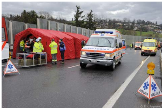
Figure 4. The advanced medical post.