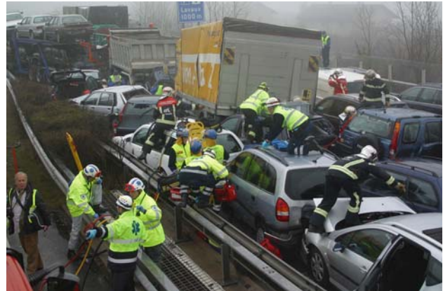
Figure 2. A tangle of cars and trucks.

slow-moving traffic in the fog caused the first cars to collide, and this was followed by a multi-car pileup.