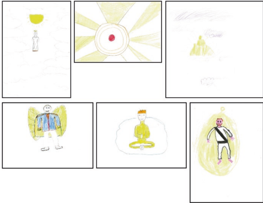
Fig. 8.2 Six drawings randomly selected from those showing yellow as the most used colour (first colour) ( http://ark.dasch.swiss/ark:/72163/1/0105/Gb3VP=5zS=2X=6CdtJeMLQn.20180702T163908277Z , http://ark.dasch.swiss/ark:/72163/1/0105/wUT9e0NbTeiUErJOTE2MEQp.20200415T114805688233Z , http://ark.dasch.swiss/ark:/72163/1/0105/duba83_9RFWEs1bTbJgvGAs.20180702T192115319Z , http://ark.dasch.swiss/ark:/72163/1/0105/faW3u0jpR6qXKYmgf0ae2Aq.20180702T193537348Z , http://ark.dasch.swiss/ark:/72163/1/0105/AEJs5pXURRmIAOaNzfhIrAZ.20180702T184940719Z , http://ark.dasch.swiss/ark:/72163/1/0105/wqqNxLCETW6GT0GNfHSHawq.20180702T155913317Z )