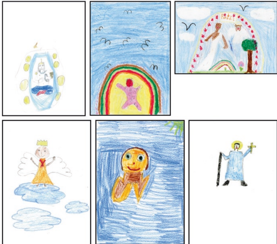
Fig. 8.4 Six drawings randomly selected from those showing blue as the most used colour (first colour) ( http://ark.dasch.swiss/ark:/72163/1/0105/4cC4qKkXQLW8oSPAT6aADwp.20200906T105031714076Z , http://ark.dasch.swiss/ark:/72163/1/0105/J0S5IzJdT1m=4qiYkq=oyAm.20201018T102738211445Z , http://ark.dasch.swiss/ark:/72163/1/0105/_BiJTMcGQAOG97ZI=cgGmQm.20201025T133709338444Z , http://ark.dasch.swiss/ark:/72163/1/0105/xC5uYo4MQm6v4eGFF4I_FgW.20180702T155057937Z , http://ark.dasch.swiss/ark:/72163/1/0105/A_4Sv4cyQoGHuAGEEEEdK7Qd.20201010T084817145761Z , http://ark.dasch.swiss/ark:/72163/1/0105/=dbCBGWWSNmRmtdtMJ5AAq.20200906T081020386126Z )