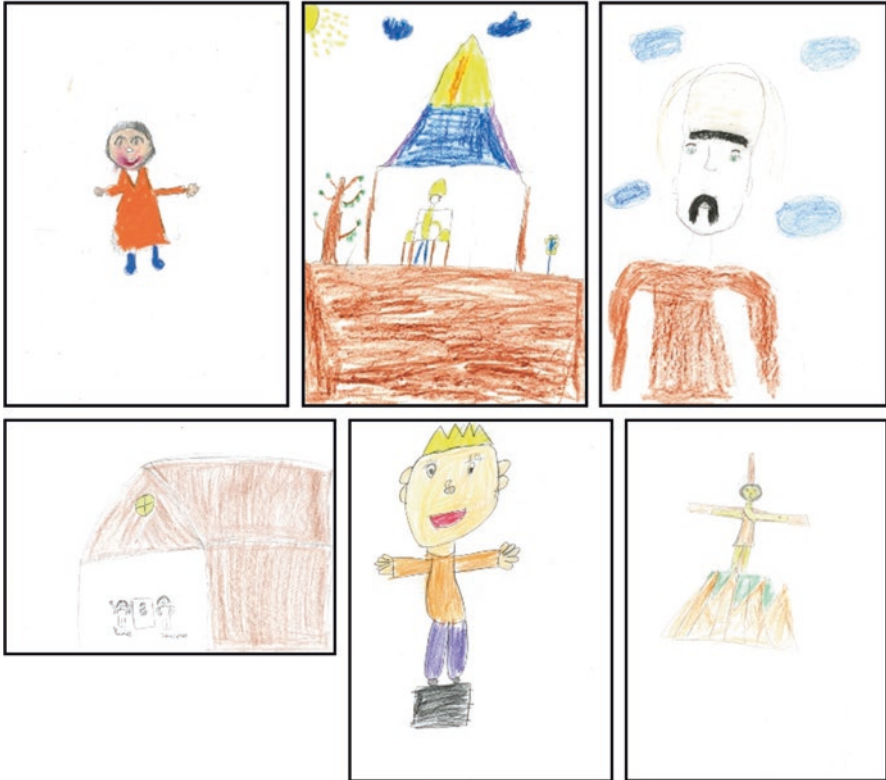
Fig. 8.3 Six drawings randomly selected from those showing orange as the most used colour (first colour) ( http://ark.dasch.swiss/ark:/72163/1/0105/fL0E98zRQHqJ7RwZuQa1zgj.20200407T134513775776Z , http://ark.dasch.swiss/ark:/72163/1/0105/NCsAzDTpQ0qPIEL1VkJ6AQ.20180702T185445084Z , http://ark.dasch.swiss/ark:/72163/1/0105/CjMDUzWCQHSFhGvfzW87YAp.20180702T190536819Z , http://ark.dasch.swiss/ark:/72163/1/0105/2O7_NopZTye_R8vr5XS_oQz.20201009T113024420355Z , http://ark.dasch.swiss/ark:/72163/1/0105/iAruZWuOTcOLYBLqPgzzigI.20200415T110229178117Z , http://ark.dasch.swiss/ark:/72163/1/0105/BtFPA2DnS2K=S9ePHep28gv.20180702T190734383Z )

the religious setting in two of the three samples (Japanese and Swiss, but not Russian-Slavic) used more blue in their drawings.