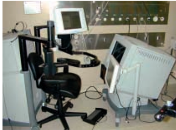
Figure 1 Operator and surgeon console.

LC was performed using a three trocar technique (two trocars were used for robotic instruments and one for the scope), as we currently use in the standard procedure, with a pneumoperitoneum of 12 mm Hg. The patient is placed in a slight reverse Trendelenburg position for better visualisation of the gallbladder. The optimal placement of the robotic arms had to be determined in order to avoid crowding by the arm's volume and thus the position of the trocars differed slightly from the standard procedure. (Figure 2.) We used a Micro-Assist Double Action fenestrated grasper (cautery compatible) and a monopolar Micro-Assist cautery probe (Computer Motion ® ) to perform robot-assisted laparoscopic cholecystectomy. Intraoperative cholangiography was performed manually because the Olsen Clamp (Storz ® ) we use can not be connected to a robot arm.