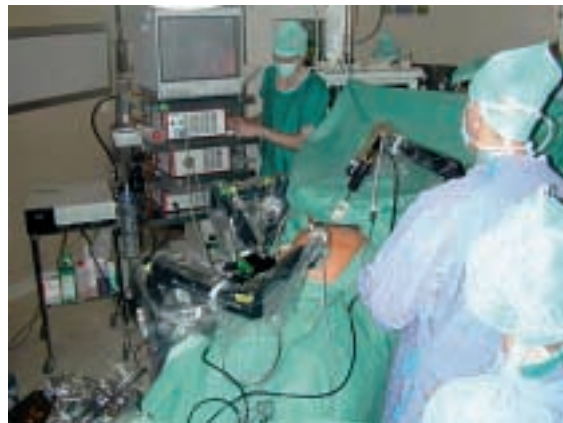
Figure 2 Position of trocars.