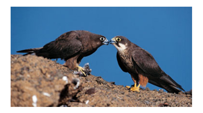
Fig. 1 A differently coloured Eleonora's Falcon ( Falco eleonorae ) breeding pair; the pale male (right) transferring a prey to the dark female (left). As can be seen, the difference in colouration between the two morphs may be mainly due to differential deposition in feathers of eumelanin pigments and to a lower extent of pheomelanin pigments.

We evaluated this prediction in the Eleonora's falcon ( Falco eleonorae ) (Fig. 1), a species that exhibits a striking melanin-based colour polymorphism with individuals displaying a pale or dark morph with little variation within these two morphs. We first tested whether mutations at Mclr are associated with the expression of a pale or dark morph and whether there is temporal variation in morph frequencies. In addition, we examined whether nestlings of the two morphs differed in cell-