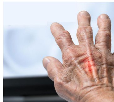
Figure 2 An image created with DALL.E (OpenAI) through artificial intelligence. The input prompt was: 'Hand with rheumatoid arthritis touching a screen'. A caption on the top left with meaningless text was removed. As so-called multimodal AI, automatic images or sketches can be created in the future to match the text provided by ChatGPT, for example, for educational purposes. AI, artificial intelligence.

gestures or similar interests and experiences as patients. In any case, chatbots and human coaches could work together on digital platforms on a broader scale.